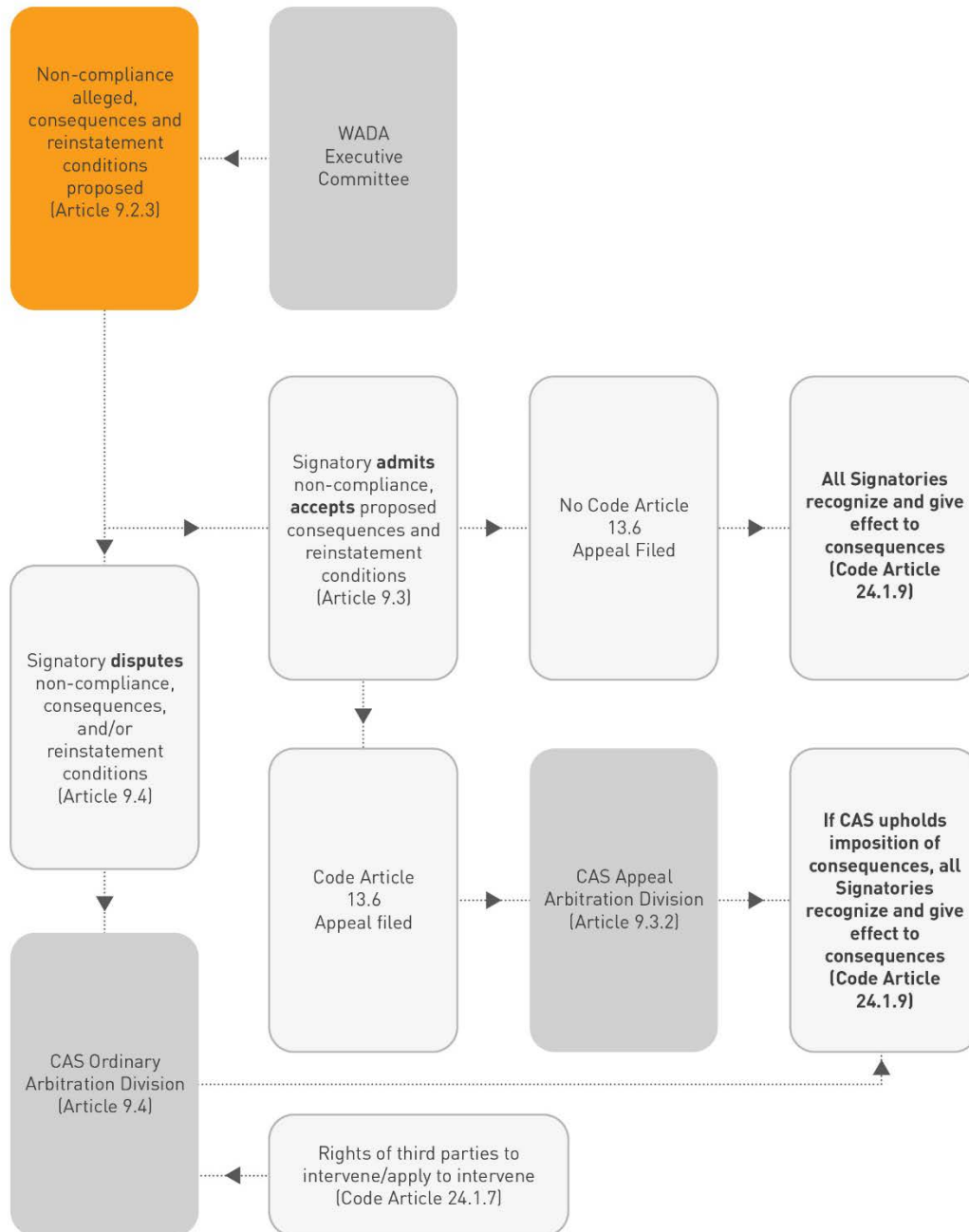
Figure Two: Flow chart depicting the process following a formal allegation of non-compliance (Articles 5.3.1, 5.3.2 and 5.3.3)